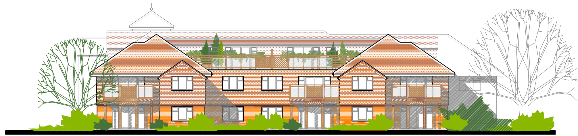
ELEVATION A - HIGH STREET